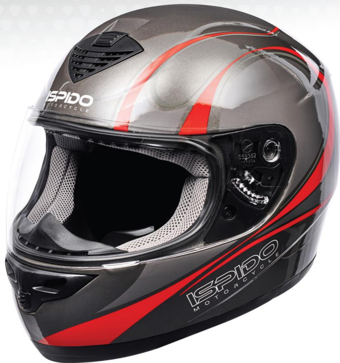
COLOUR: Black/Red/Silver/Gray CATALOGUE NO.: IS0104/18/27