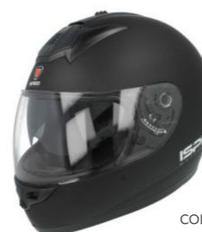
COLOUR: Black/Mat CATALOGUE NO.: ISO108/14/12