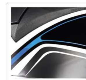
COLOUR: Black CATALOGUE NO.: ISO108/14/10

Zonda SV is an example how a very good quality can be offered in an unusual attractive price. This model offers a necessary standard for motorcyclists who start their adventure with two wheels but also for these who have a limited budget. A good ventilation system is provided by an expanded forehead vent and intake vent on the top of chin. It has a removable inner liner and cheek pads and an internal drop-down sun visor and sun visor as well.