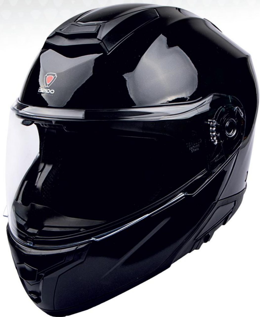
COLOUR: Black CATALOGUE NO.: ISO115/16/10