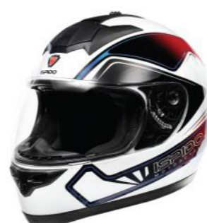
COLOUR: White/Red/Blue CATALOGUE NO.: ISO108/18/25