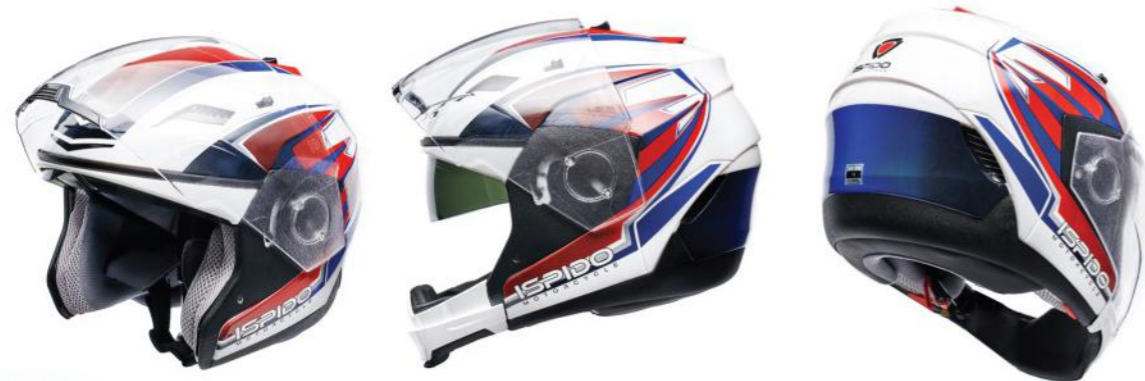
COLOUR: White/Red/Blue CATALOGUE NO.: IS0116/18/26