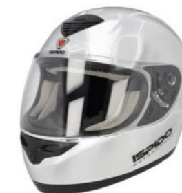
COLOUR: White CATALOGUE NO.: IS0104/18/20