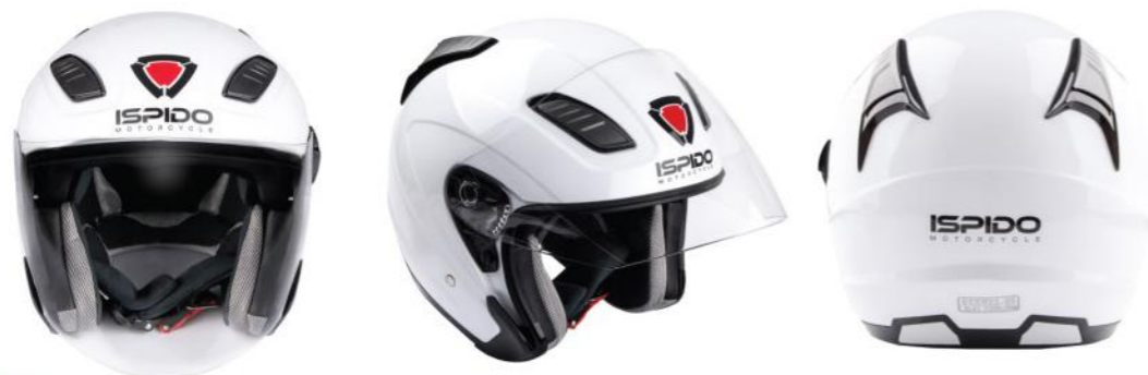
COLOUR: White CATALOGUE NO.: ISO101/14/20