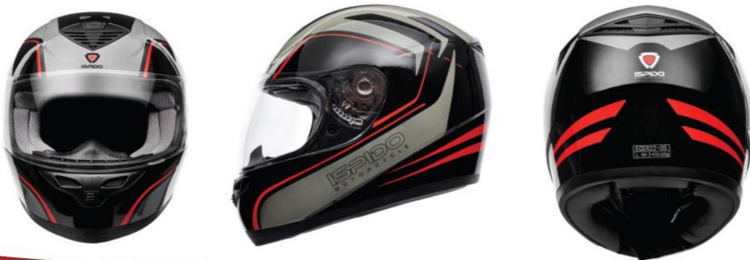
COLOUR: Black/Red/Gray CATALOGUE NO.: IS0104/18/25