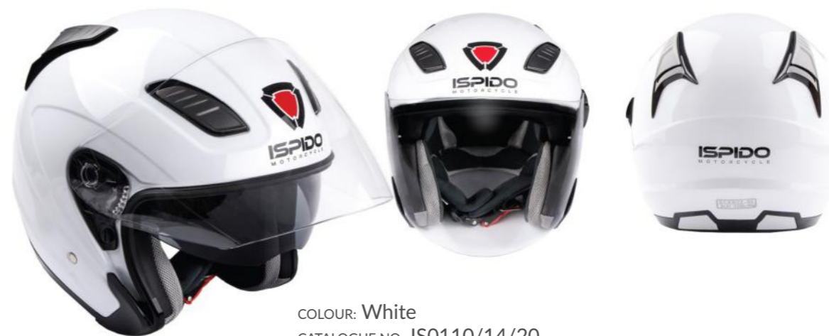
COLOUR: White CATALOGUE NO.: ISO110/14/20