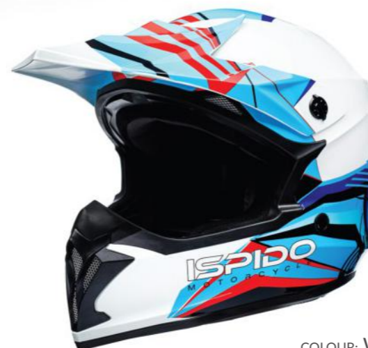
COLOUR: White/Blue/Red CATALOGUE NO.: IS0105/18/19