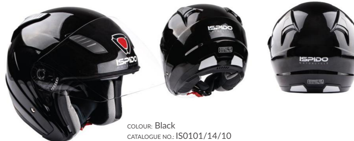
COLOUR: Black CATALOGUE NO.: ISO101/14/10