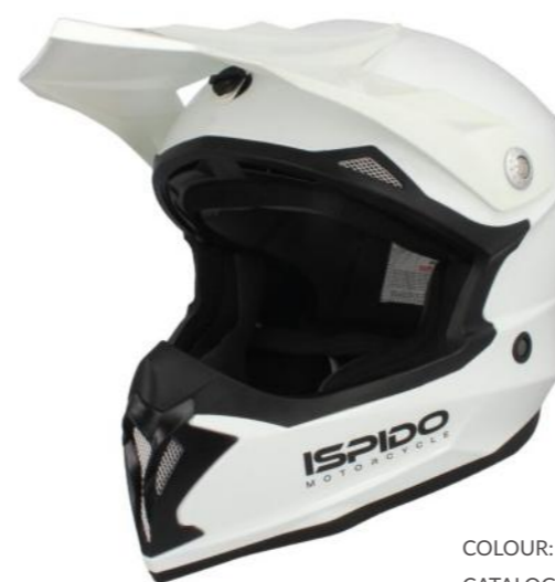
COLOUR: White CATALOGUE NO.: IS0105/18/20