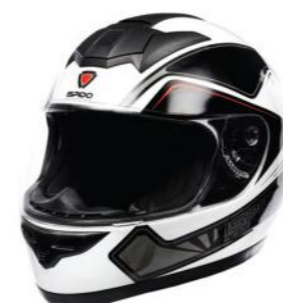
COLOUR: White/Black/Red/Gray CATALOGUE NO.: ISO108/18/24