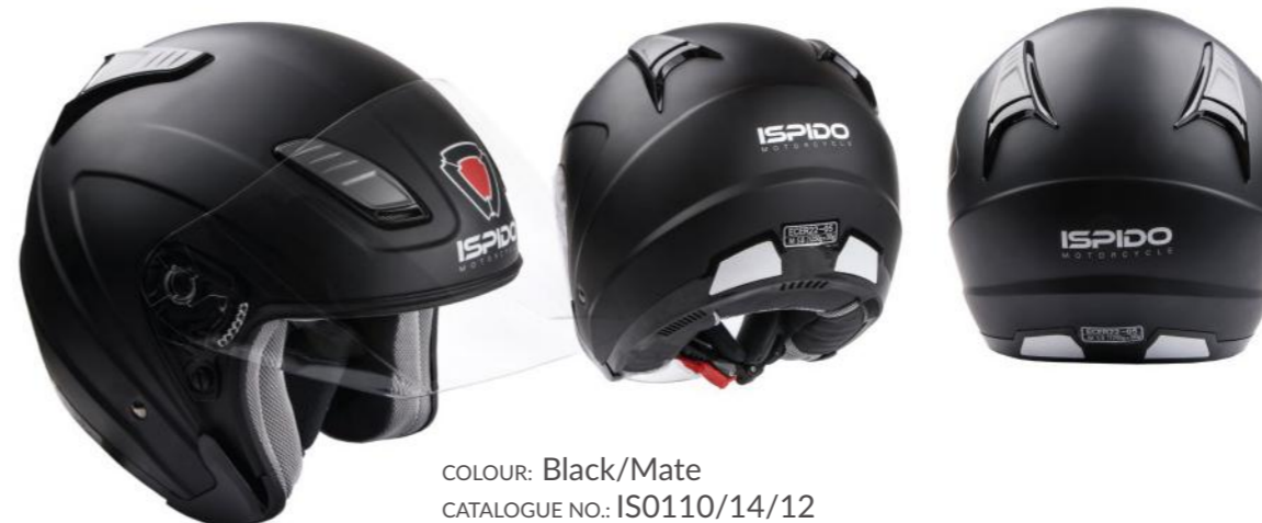
COLOUR: Black/Mate CATALOGUE NO.: ISO110/14/12