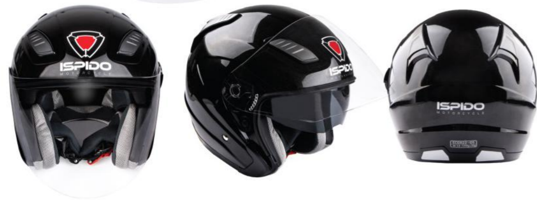
COLOUR: Black CATALOGUE NO.: ISO110/14/10