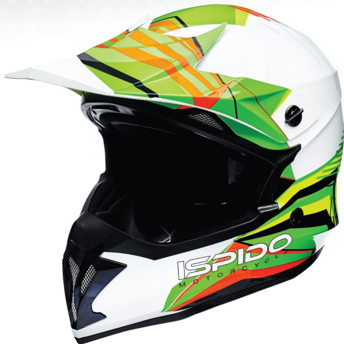
COLOUR: White/Green/Orange CATALOGUE NO.: IS0105/18/17