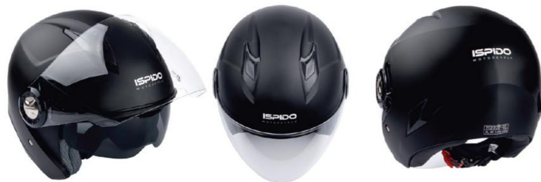
COLOUR: Black/Mat CATALOGUE NO.: IS0111/15/12

Jet SV is a classic open face helmet dedicated for riding city scooters and classic-cruiser motorcycles as well. The project has been made according to the latest trends what means that the special shell shape is complemented with big intake vents and main visor with an extensive field of view. A blockbuster in this price category is removable lining and a sun visor.