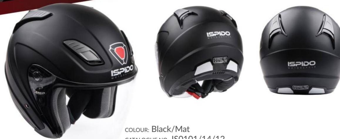
COLOUR: Black/Mat CATALOGUE NO.: ISO101/14/12