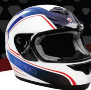
COLOUR: White/Red/Blue CATALOGUE NO.: IS0104/18/22