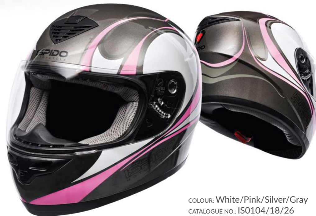
COLOUR: White/Pink/Silver/Gray CATALOGUE NO.: IS0104/18/26