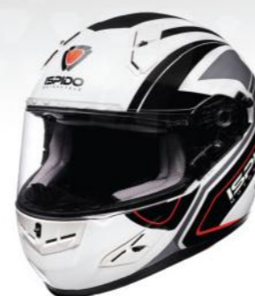
COLOUR: White/Black/Silver CATALOGUE NO.: IS0113/18/25