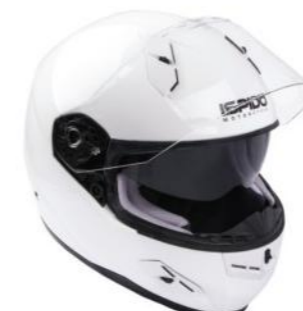
COLOUR: White CATALOGUE NO.: IS0113/15/20