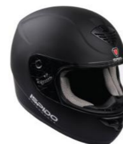
COLOUR: Black/Mat CATALOGUE NO.: IS0104/14/12