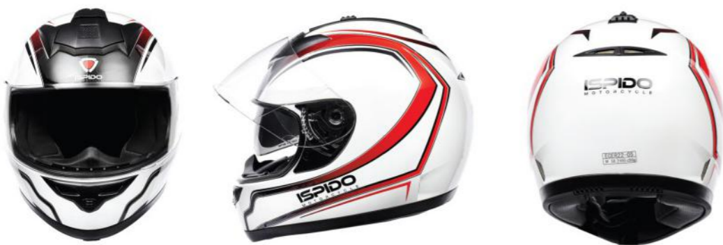
COLOUR: White/Black/Red CATALOGUE NO.: ISO108/18/22