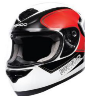
COLOUR: White/Black/Red CATALOGUE NO.: IS0104/18/23