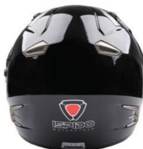
COLOUR: Black CATALOGUE NO.: IS0109/14/10

Desert absolutely has the best price in DUAL helmets category. It meets the enduro motorcyclists' and ATV owners' requirements thanks to being equipped with a detachable peak, a transparent main visor and an internal drop-down sun visor. Sun visor's lever is located in an easy to reach place. 5 front vents and 4 rear vents provide a proper ventilation system.