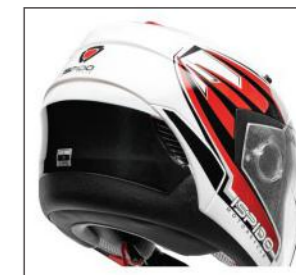
COLOUR: White/Black/Red CATALOGUE NO.: IS0116/18/25