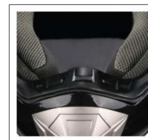
COLOUR: Black/Mat CATALOGUE NO.: IS0109/14/12