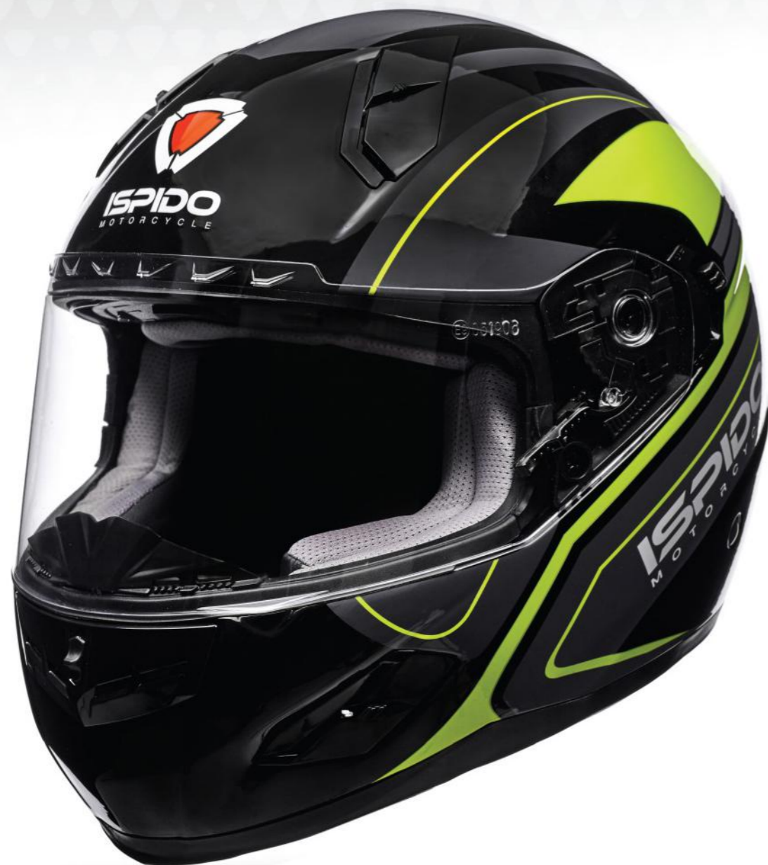
COLOUR: Black/Fluo/Gray CATALOGUE NO.: IS0113/18/31