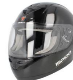
COLOUR: Black CATALOGUE NO.: IS0104/14/10