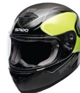
COLOUR: Black/Fluo/Gray CATALOGUE NO.: IS0104/18/24