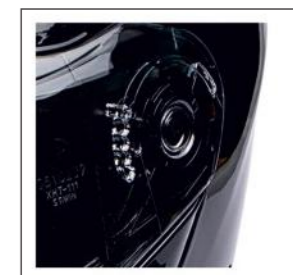
COLOUR: Black/Mat CATALOGUE NO.: ISO115/16/12