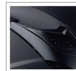
COLOUR: Black CATALOGUE NO.: IS0111/15/10